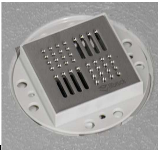
Standard Grate (001.00035)