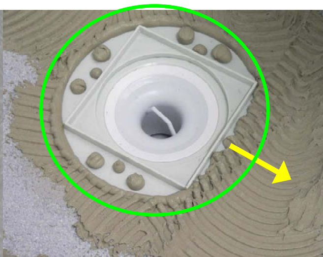
Free Floating Grate Retaining Ring (comes with 001.00034/5)